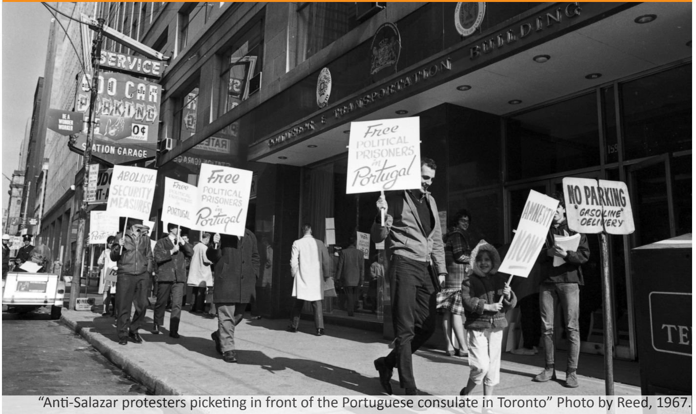
"Anti-Salazar protesters picketing in front of the Portuguese consulate in Toronto"